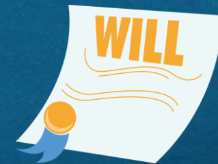
Probate & Advance Directives